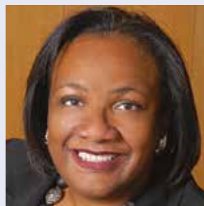
Diane Abbott MP Member of Parliament UK PARLIAMENT