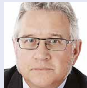
Justice Norris UK HIGH COURT